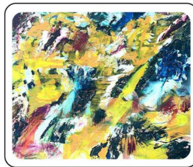
Title: Innate Turmoil Year: 2003 Medium: Oil Paint Size: 50*70

Within this inner chaos, the viewer is invited to begin anew the unfinished journey of the soul—with their gaze as the guide.