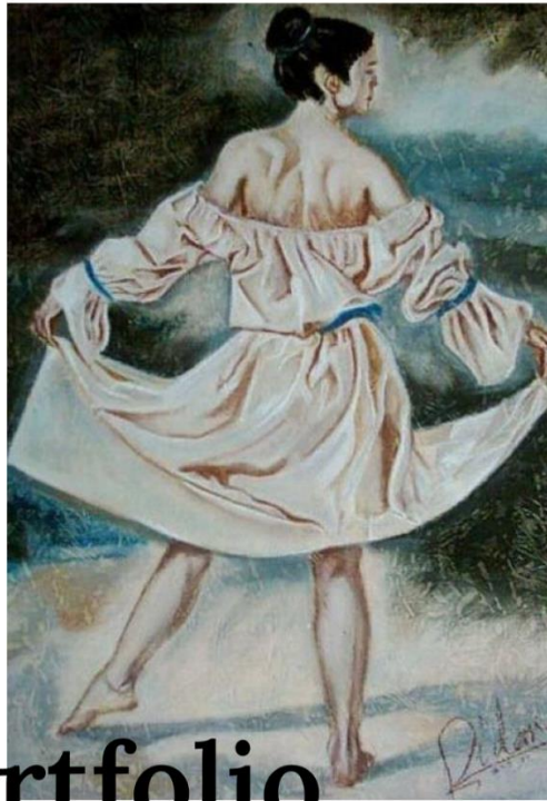
Title: Turned Away from the World, Facing the Self Year: 2005 Medium: Chalk Pastel Size: 50*70