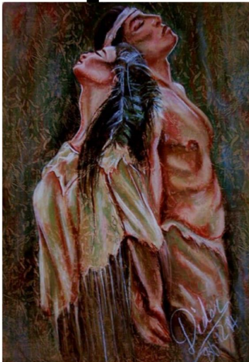
Title: Silent Longing Year: 2005 Medium: Chalk Pastel Size: 50*70