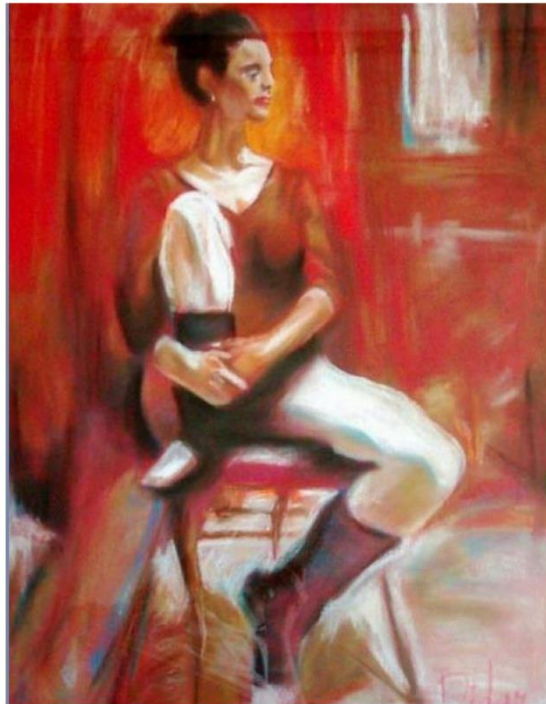
Title: Contemplation in Silence Year: 2005 Medium: Chalk Pastel Size: 50 × 70 cm