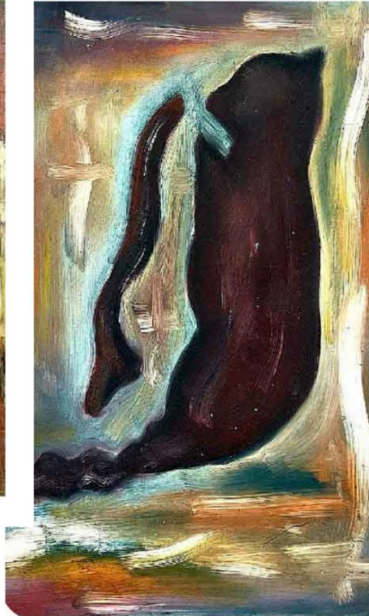
Title: Born from within Year: 2006 Medium: Oil Paint Size: 50*70

Colors in this work play a psychological role: fiery tones like red and orange, especially in the central area, evoke the warmth of life, the desire for liberation, and an inner rebirth, while the surrounding greens and browns suggest rootedness, silence, and the depth of the unconscious.