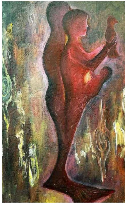
Title: Reflection of liberation Year: 2006 Medium: Oil Paint Size: 60*70

In this painting, through a symbolic language, the innermost layers of human existence intersect with the yearning for liberation. A human-like figure, immersed in an aura of warm and cool tones, embraces a bird with open hands—a bird symbolizing freedom, peace, or perhaps a repressed dream.